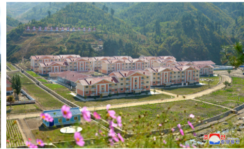
Photos show farmhouses of stylish designs newly built in rural villages across the country.