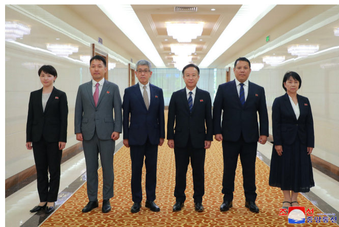
A congratulatory group of Koreans in Japan for celebrating the 76th anniversary of the DPRK arrives in Pyongyang on September 5.

who formed the General Association of Korean Residents in Japan and made immortal contributions to the development of the movement of Koreans in Japan.