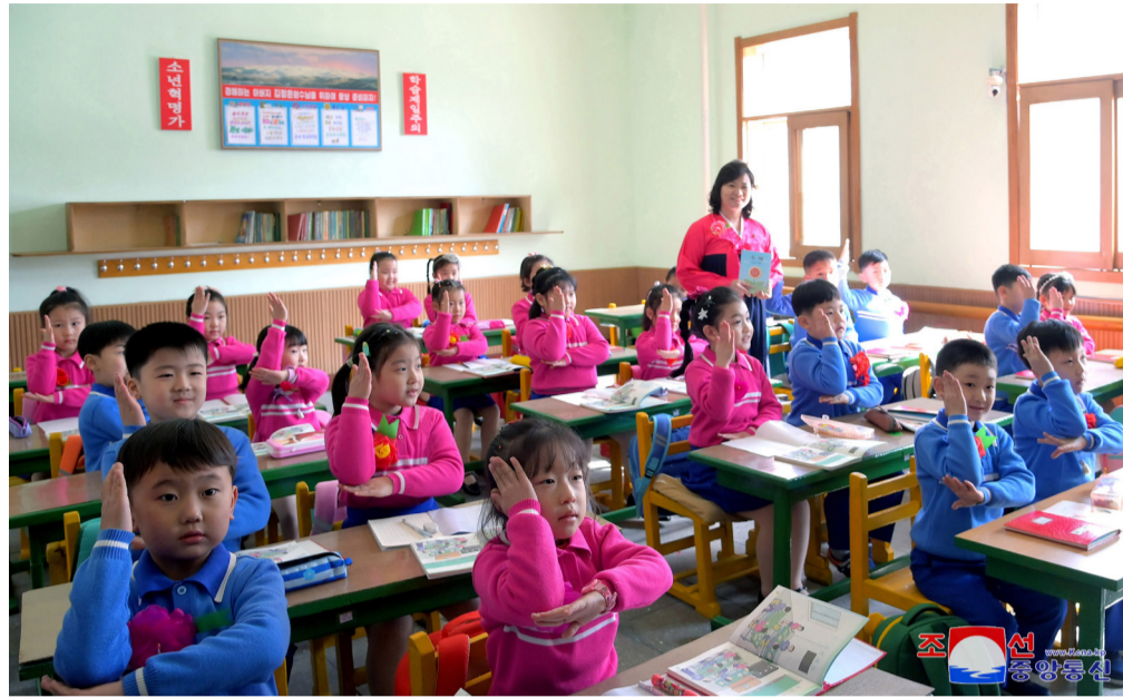
Students learn to their heart's content under the benefits of the universal 12-year compulsory education system.