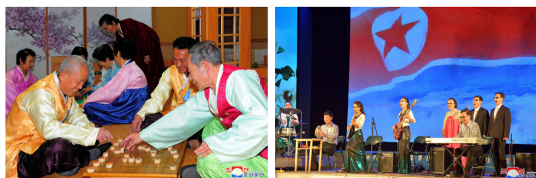
People enjoy a happy life under the state benefits.