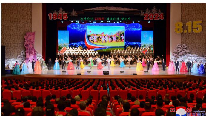
Performances are given at theatres across the country to celebrate the 79th anniversary of national liberation.

The cultural recreation centres in Pyongyang, including the Central Zoo, Natural History Museum and Munsu Water Park, resounded with happy laughter of the working people, students and children who were spending a good time there.