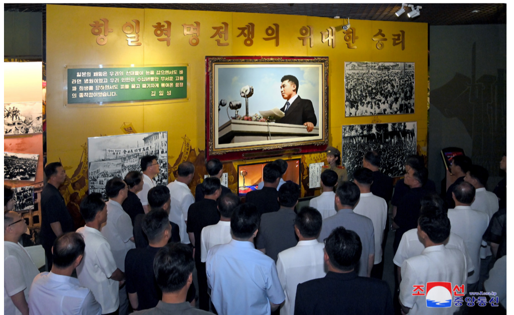
Officials of ministries and national agencies visit the Victorious Fatherland Liberation War Museum on August 15.

They strengthened their conviction that the revolutionary cause of the DPRK which is firmly carrying forward the brilliant traditions of the anti-Japanese war is invincible.