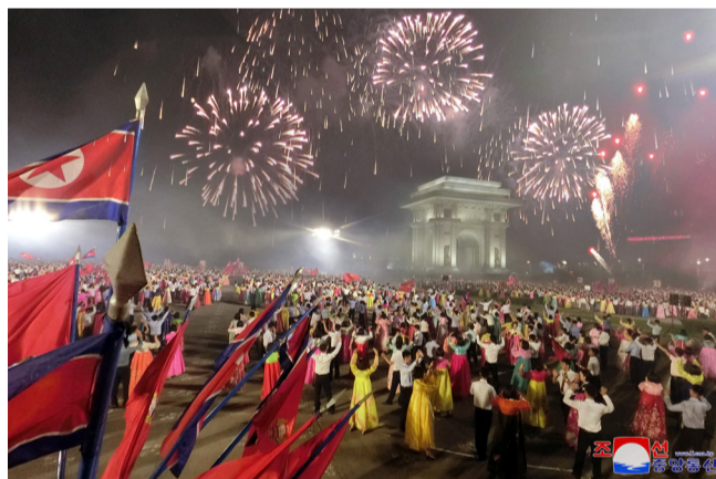
An evening gala of youth and students takes place at the plaza of the Arch of Triumph on August 15.

The atmosphere was charged with excitement as fireworks suddenly exploded into the night.