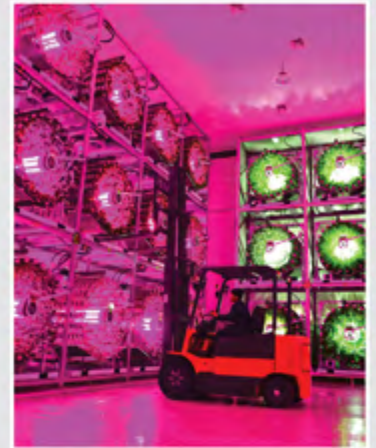
Kangdong Greenhouse Complex