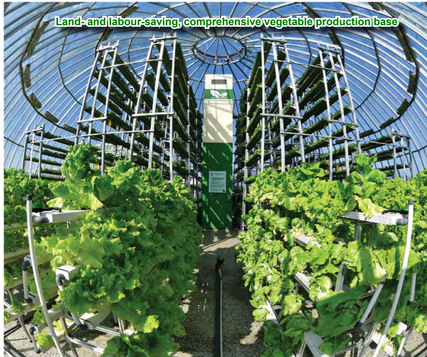
Land- and labour-saving, comprehensive vegetable production base

sloping-sided glass hydroponic greenhouses, public buildings, and multi-storeyed, low-rise and