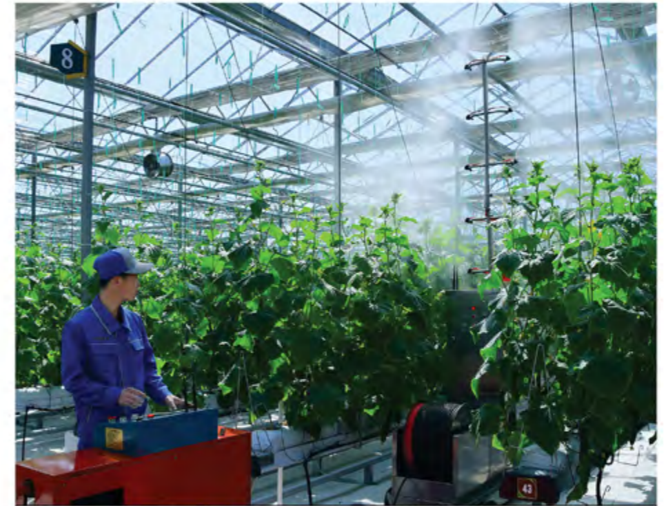
Production of functional vegetables with beneficial nutritional and medicinal effects

There is a greenhouse which cultivates vegetable crops on several tiers by using LED lamps, and another has horizontally distributed racks which are fixed to a revolving frame moving vertically so as to raise the light utilization efficiency markedly without additional illumination and thus give fullest play to the