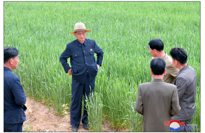
Premier Kim Tok Hun (second from left) inspects the Jongbong Farm in Singye County.