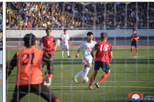
Glimpses into the men's football final, 4×100 metre relay and amusement games which are held as part of the Sports Contest of Workers in Major Industrial Sectors-2024 at Kim Il Sung Stadium in Pyongyang on May 1.