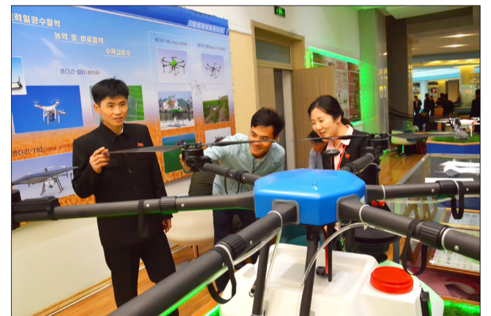
Visitors show keen interest in the 37th National Festival of Science and Technology at Pyongyang's Sci-Tech Complex.

The Academy of Agricultural Science presented proposals conducive to putting agricultural production on a scientific, modern and IT basis, including active fertilizer for plants, composite microbial treatment agent, plant growth regulator, agricultural sci-tech diffusion system "Hwanggumpol (golden field)", agricultural sci-tech service system