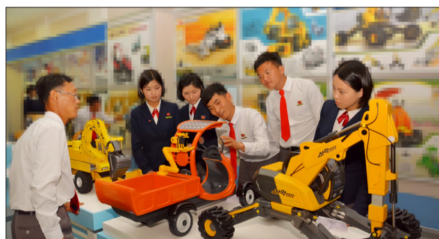
Students look round the venue of the national industrial design exhibition.

As an event for wide-ranging sci-tech exchanges and cooperation, the festival served as an important occasion for promoting social progress and the comprehensive rejuvenation of the country with the steady development of the sci-tech capability and practical vitality of the policy of attaching importance to science and technology.