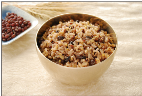
A dish made with all five grains.

Today, the Korean people still celebrate Jongwoldaeborum as a traditional holiday every year and the holiday and the custom of welcoming the first full moon were registered as national ICH elements.