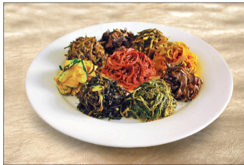
Nine dishes of dried herbs.