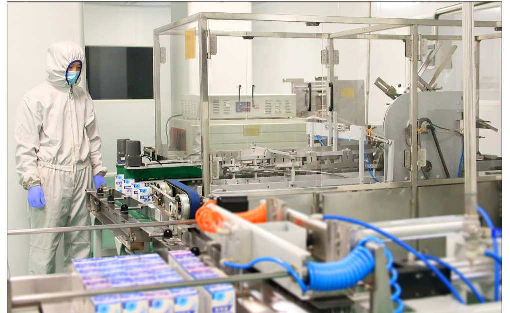
An employee watches the medicine packing process of the refurbished Pyongyang Pharmaceutical Factory.