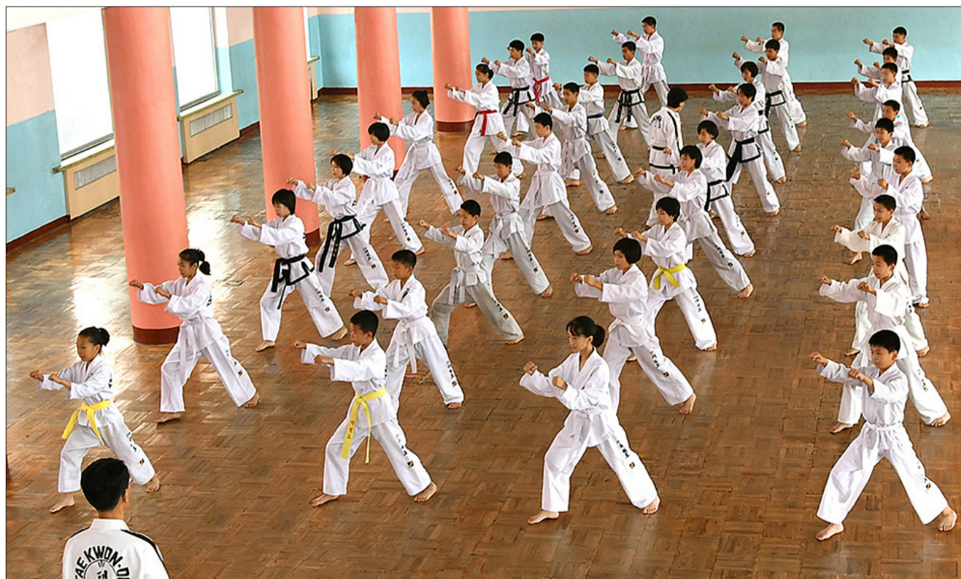
Taekwon-Do is popularized as its techniques are diffused widely.

Today nationwide programmes are undertaken in the DPRK to develop the Korean martial art.