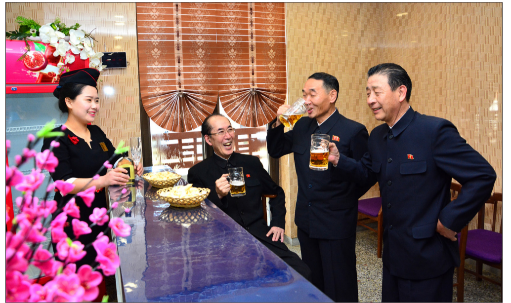
Senior citizens have a good time of rest at Hwasong Health Complex for the Elderly No. 2 of the Hwasong District Public Welfare Service Station.

when he received kind service at the health complex built in the new street under the public respect and preferential treatment for the