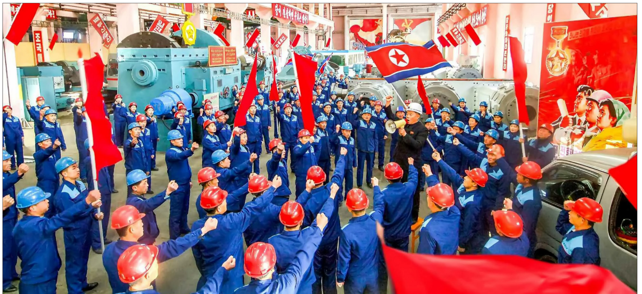
Workers pledge to implement the decisions of the Ninth Plenary Meeting of the Eighth Central Committee of the Workers' Party of Korea at the Ryongsong Machine Complex.

When the Chollima spirit of the new era created in Ryongsong spreads like wildfire across the country, it will produce valuable assets of self-reliance in succession in all sectors of the self-supporting economy.