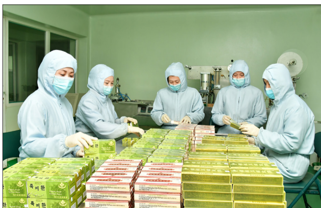
The Junggu Koryo Medicine Pharmaceutical Factory turns out highly-efficacious traditional medicines.

The factory is now making redoubled efforts to produce a larger quantity of Koryo medicines with higher efficacy.