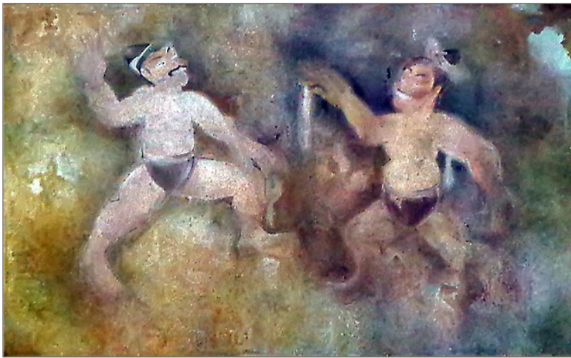
Left: Subak painted on the stone wall of the Mausoleum of King Ko Kuk Won.

The Korean orthodox martial arts were trampled