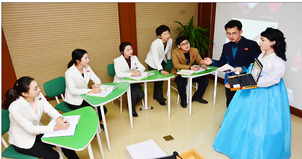
Lecturers have a group discussion to perfect the educational control system based on robot at Pyongyang Teachers Training College.

Well over a hundred lecturers have won the title of October 8 model lecturer, got the certificate of registration of new teaching methods and earned lots of certificates at national presentations and exhibitions and the college became one of the top 10 informatization model units in 2022 after 2018.