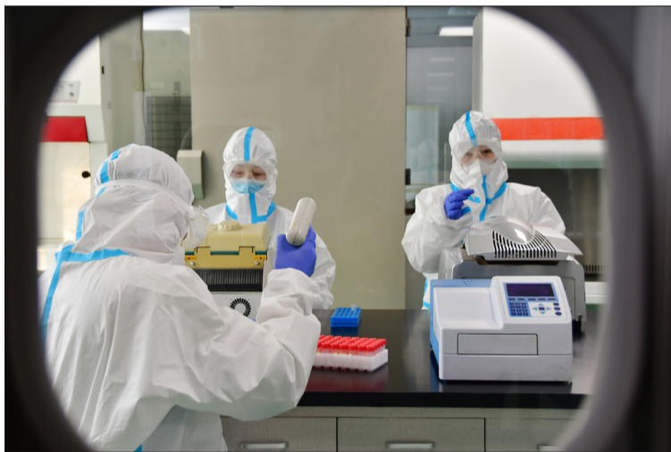
Medical workers are engaged in nucleic acid test at the National Centre for Disease Control and Prevention.

This year, the centre has plans for many practical undertakings to prevent the outbreak and spread of different kinds of infectious diseases and ensure clean environment and hygienic safety.