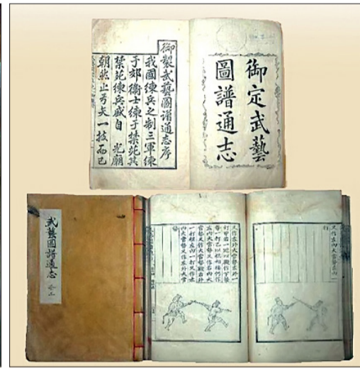
Right: "Muyedobothongji", Illustrated Book of Martial Arts, in which traditional martial art movements are systematized in a comprehensive way.

down by the vicious moves of the Japanese imperialists to obliterate the martial arts of the Korean nation during the period of their military occupation of Korea between 1905 and 1945.