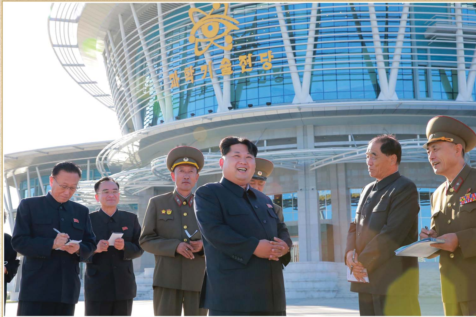
Kim Jong Un visiting the Sci-Tech Complex in October Juche 104 (2015)

True to the ennobling intention of the WPK to turn all the rural villages across the country on a par with those of Samjiyon City and into well-off and civilized ideal socialist villages in the near future, new rural villages were built across the country, followed by merry and happy house-moving events.