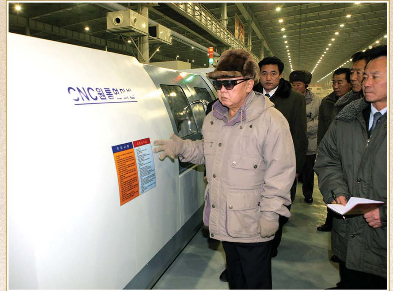
Kim Jong Il seeing new CNC machine tools in December Juche 99 (2010)

The victorious course of the DPRK is associated with the devotion of Chairman Kim Jong Il for the country and people.