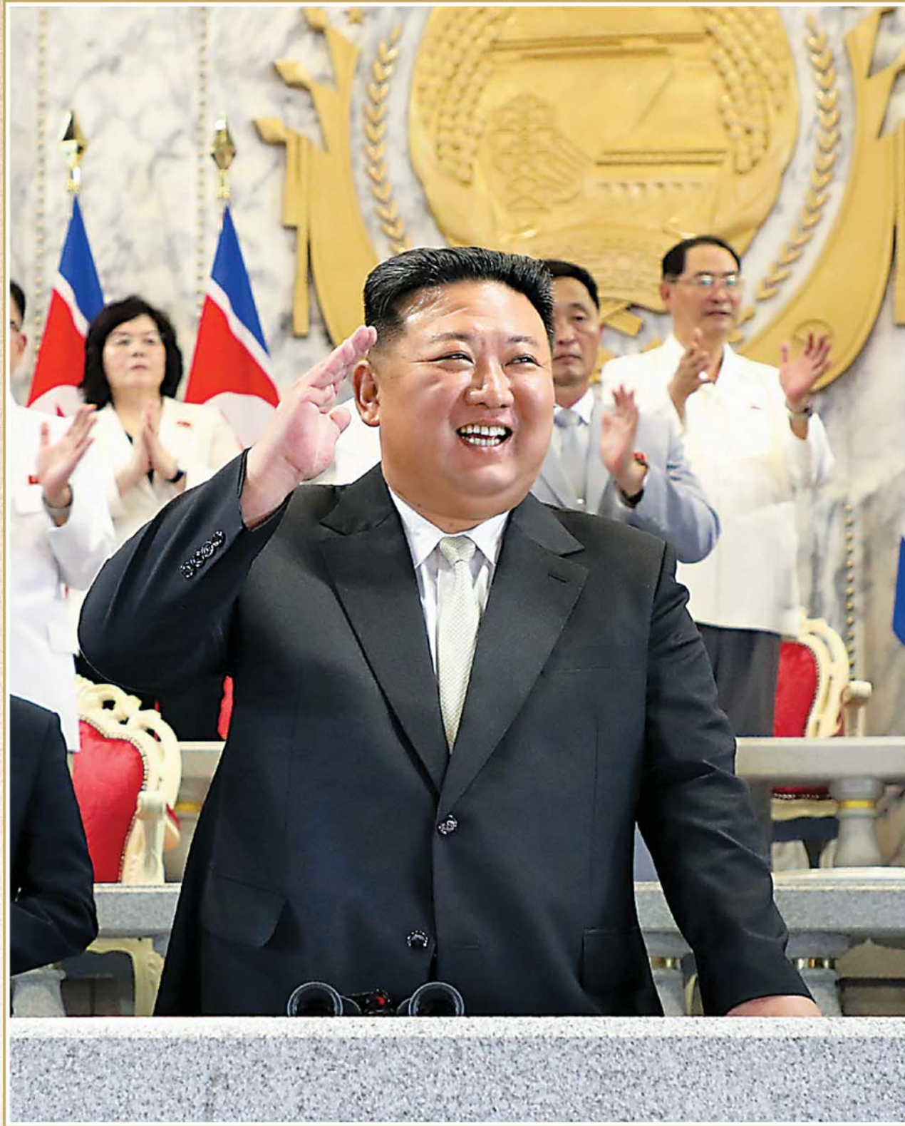
Kim Jong Un extending militant greetings to the parade columns in July Juche 112 (2023)