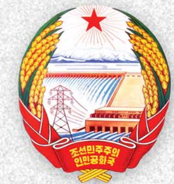
National emblem of the DPRK