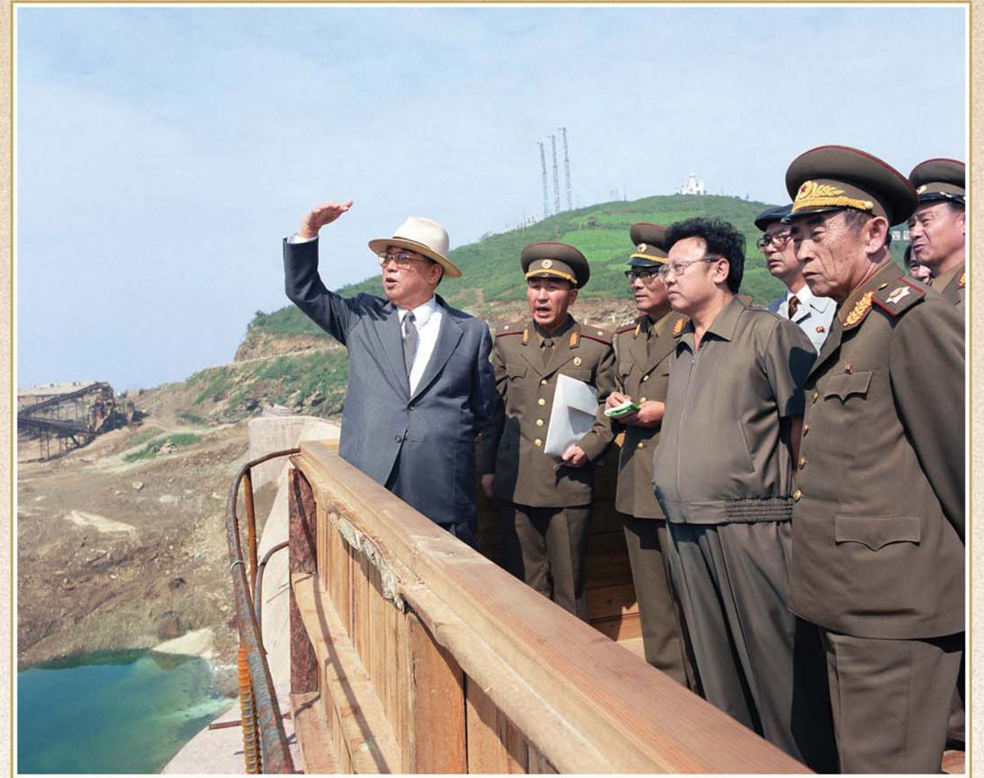
Kim Il Sung and Kim Jong Il inspecting the construction site of the West Sea Barrage in September Juche 74 (1985)