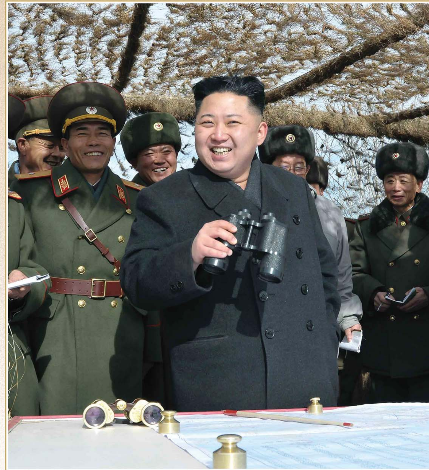
Kim Jong Un inspecting KPA units on the southwestern front in February Juche 101 (2012)