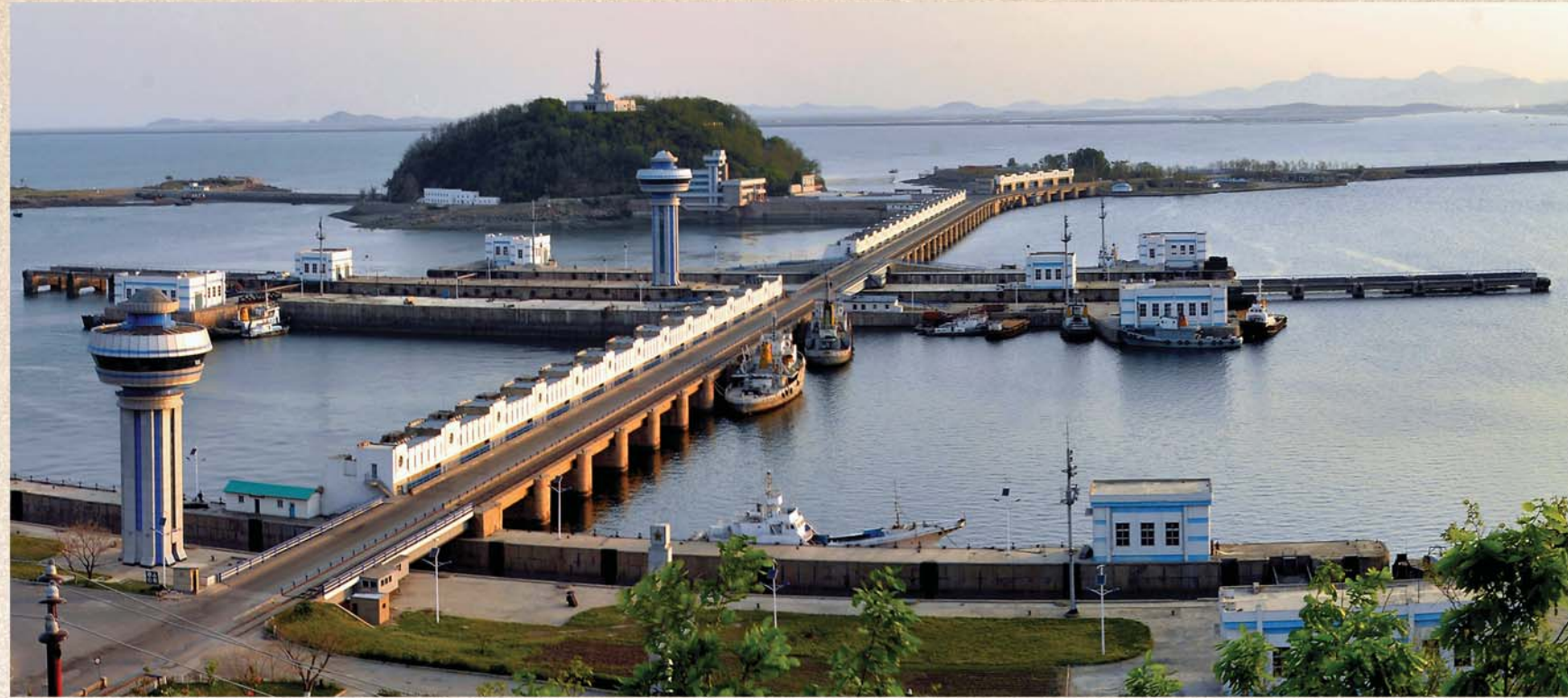
The 8km-long West Sea Barrage was built in five years.