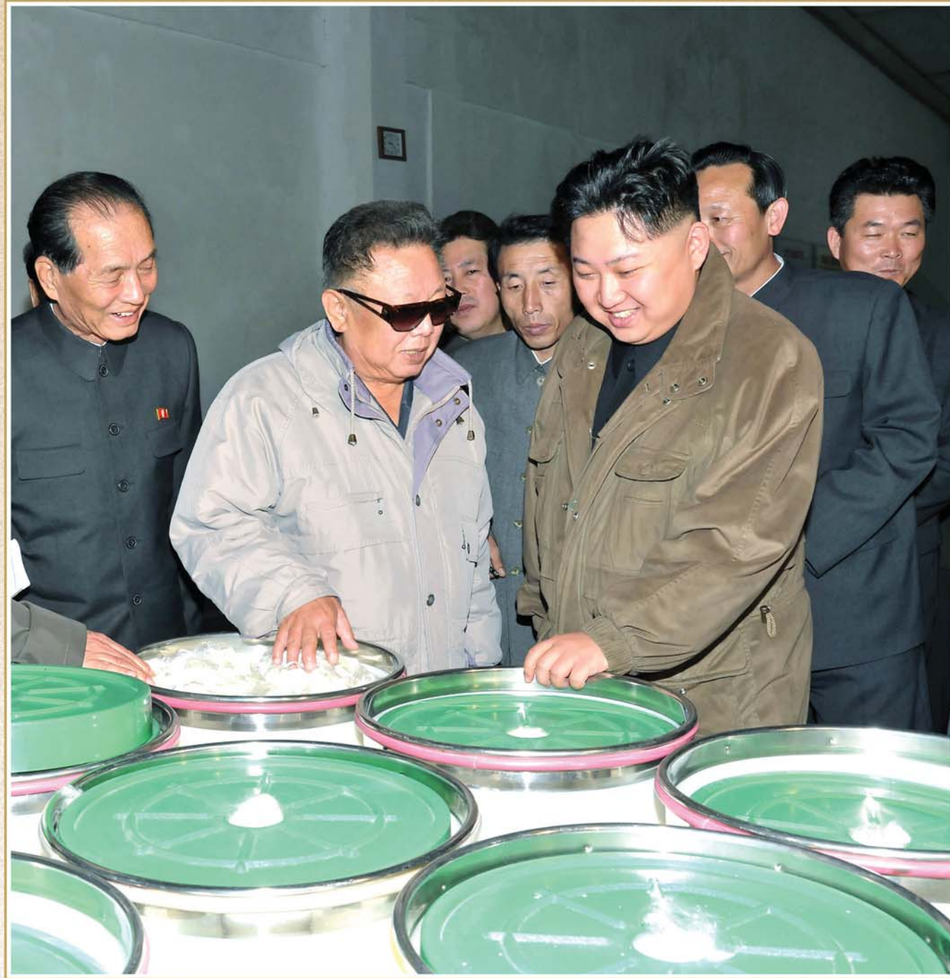
Kim Jong Il and Kim Jong Un at the February 8 Vinalon Complex in October Juche 100 (2011)