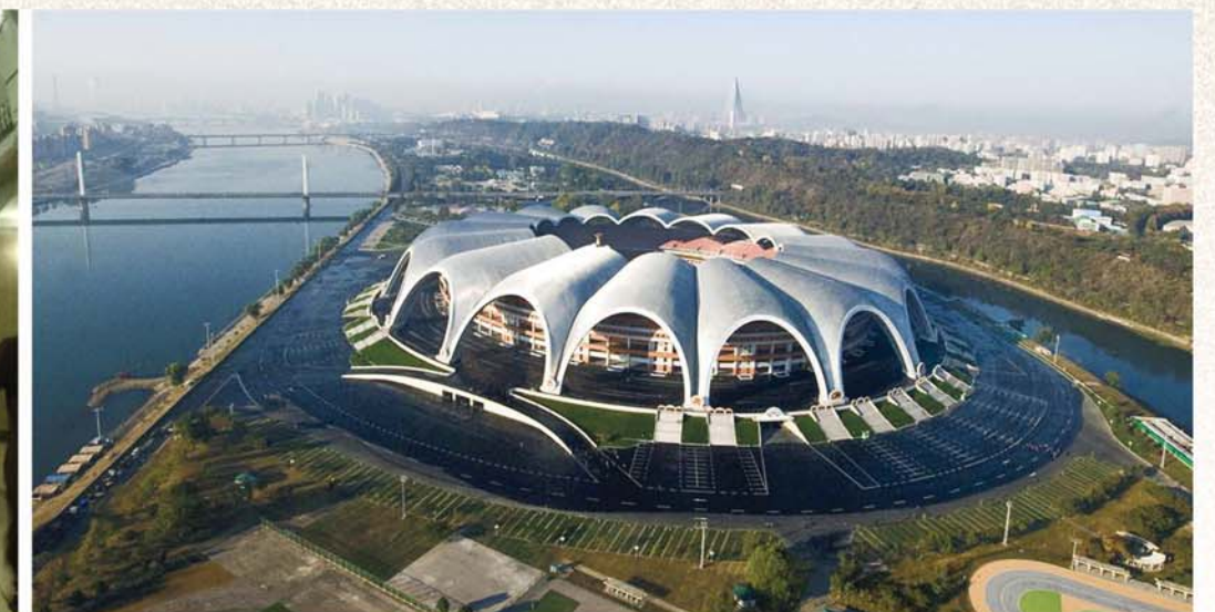
Grand monumental edifices, including Kwangbok Street, Pyongyang Metro and May Day Stadium, sprang up.