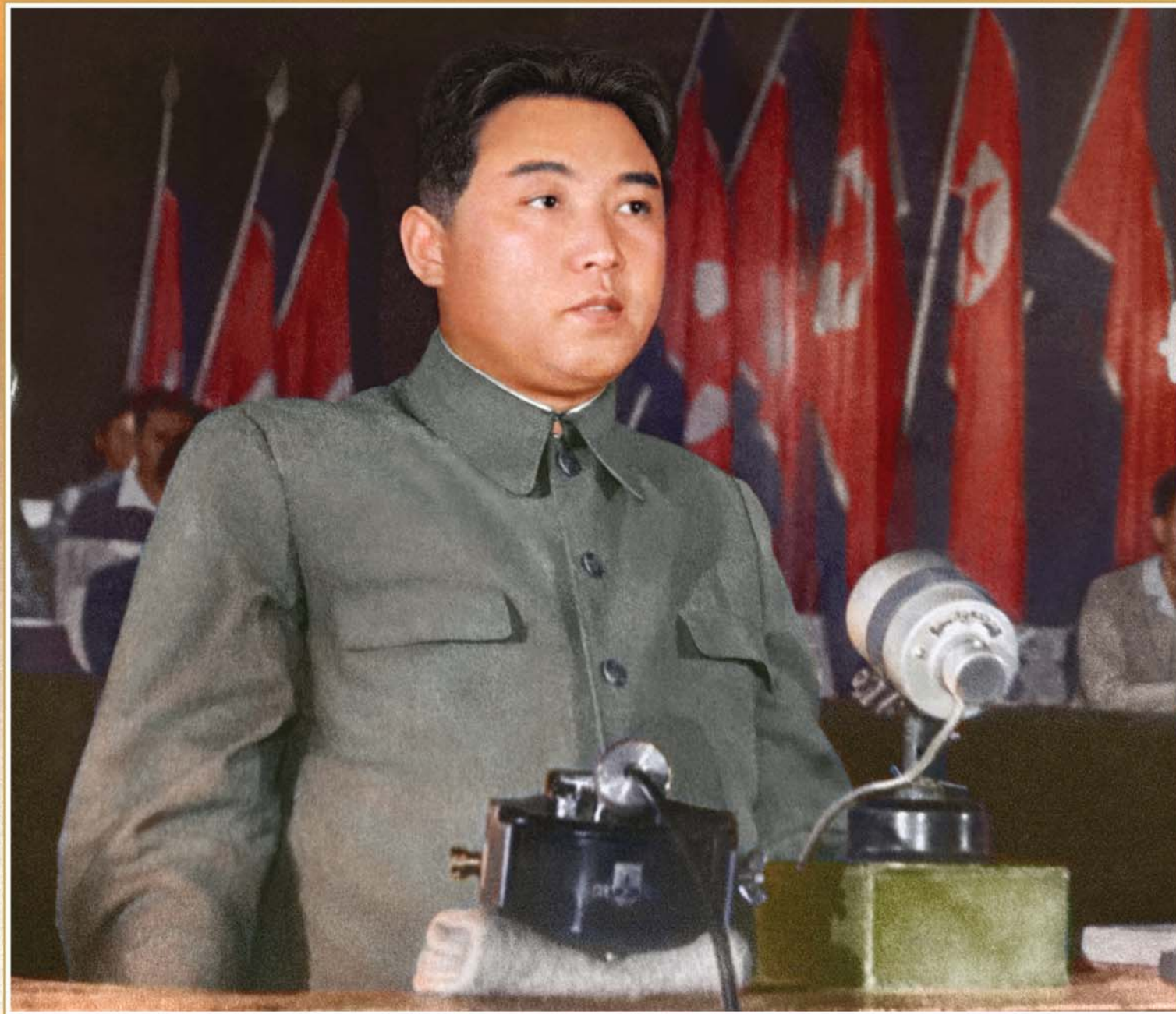
The great leader Comrade Kim Il Sung, founder of the DPRK

Brilliant victory in the anti-Japanese armed struggle achieved under the leadership of Kim Il Sung in August Juche 34 (1945) opened a broad way for the Korean people to build a state.