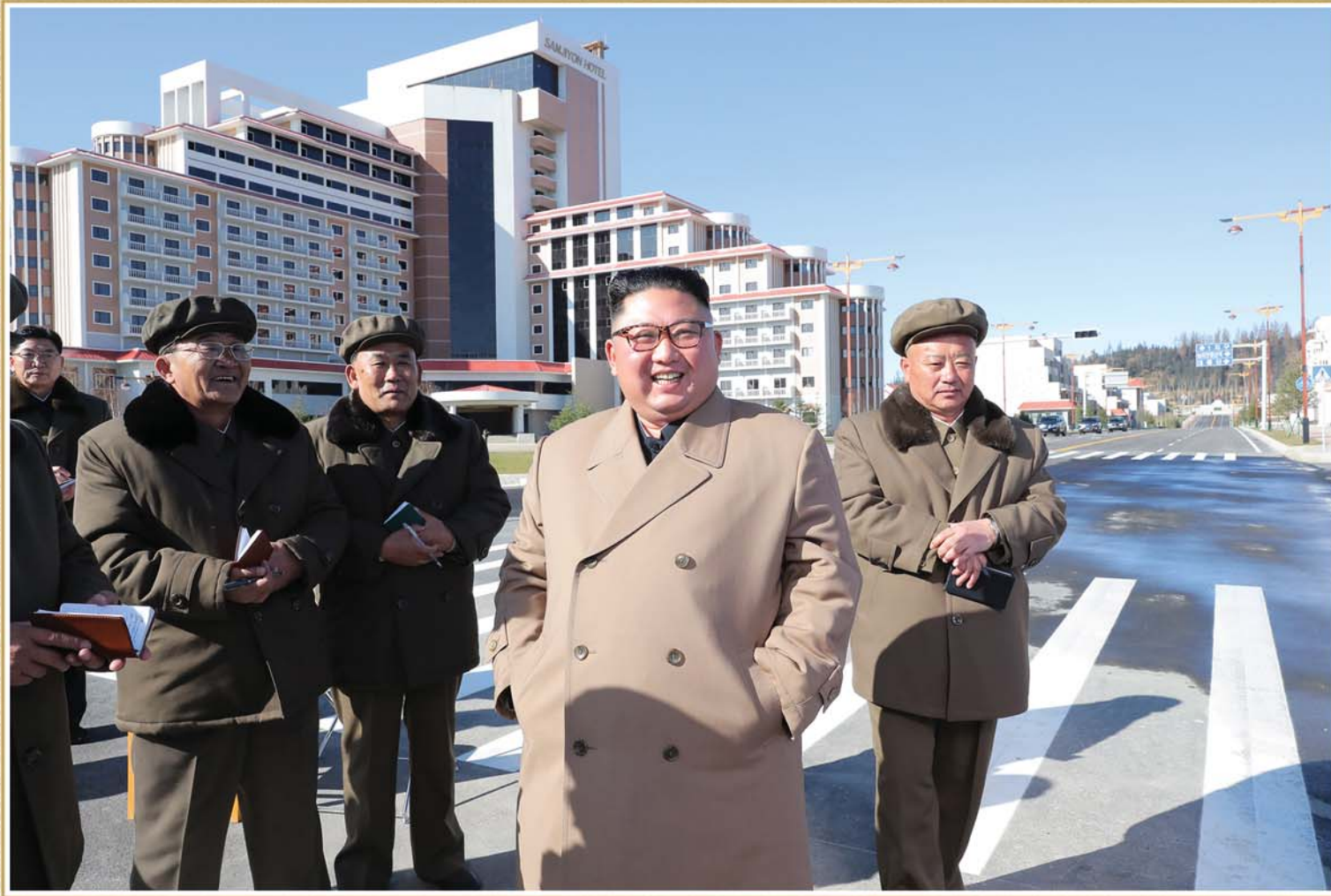
Kim Jong Un looking round the construction sites in Samjiyon County in October Juche 108 (2019)