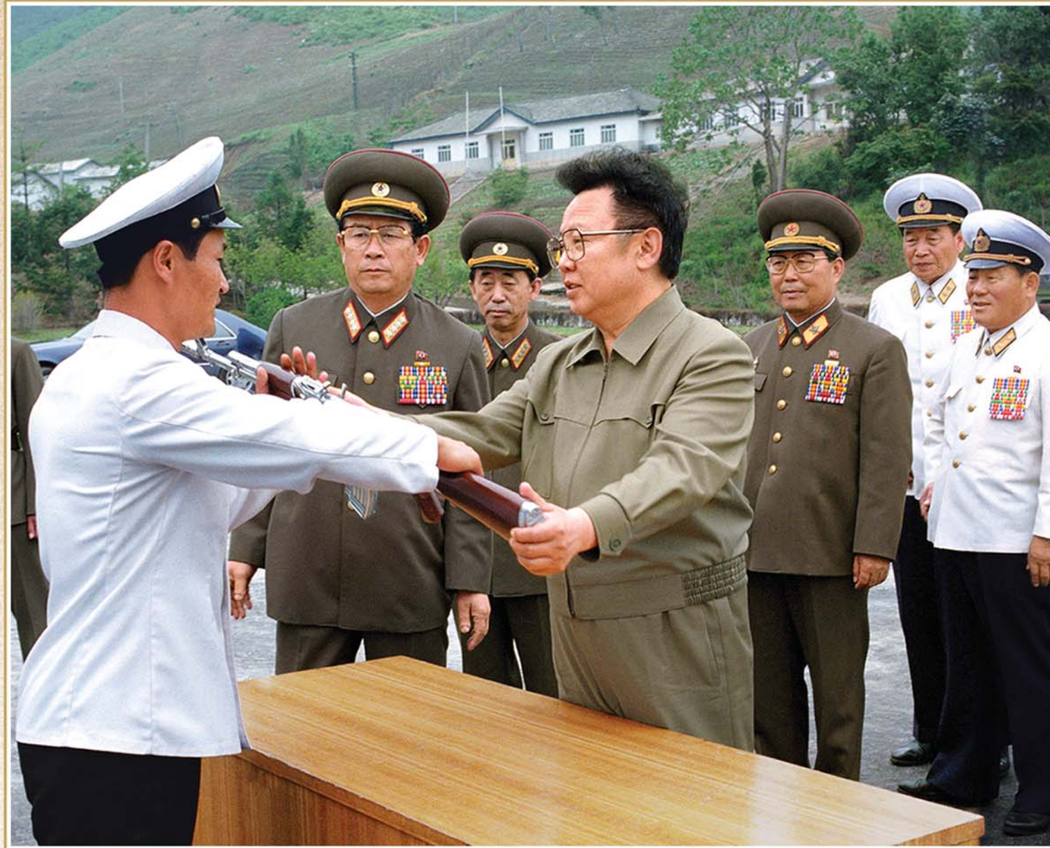
Kim Jong Il handing over a rifle at a KPA navy unit in June Juche 86 (1997)