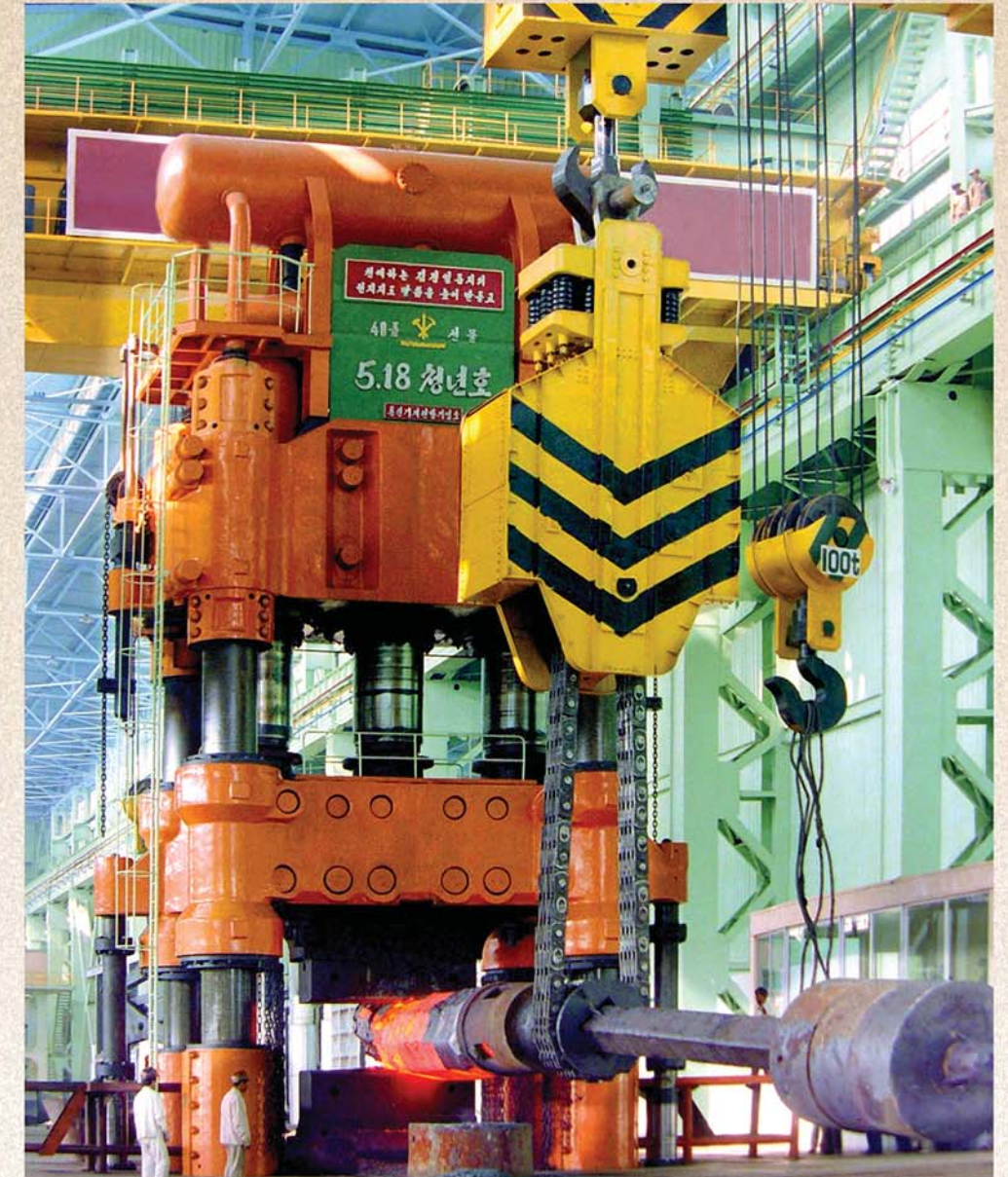
10 000-ton press manufactured by the workers of Ryongsong

Under the energetic leadership of Kim Il Sung, the DPRK brilliantly fulfilled the task of socialist industrialization in a short period of only 14 years, despite difficult conditions and circumstances.