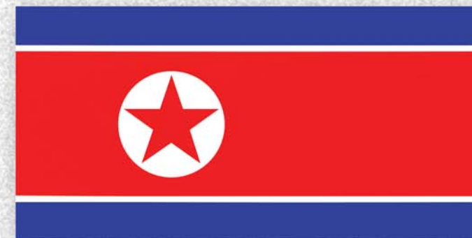
National flag of the DPRK