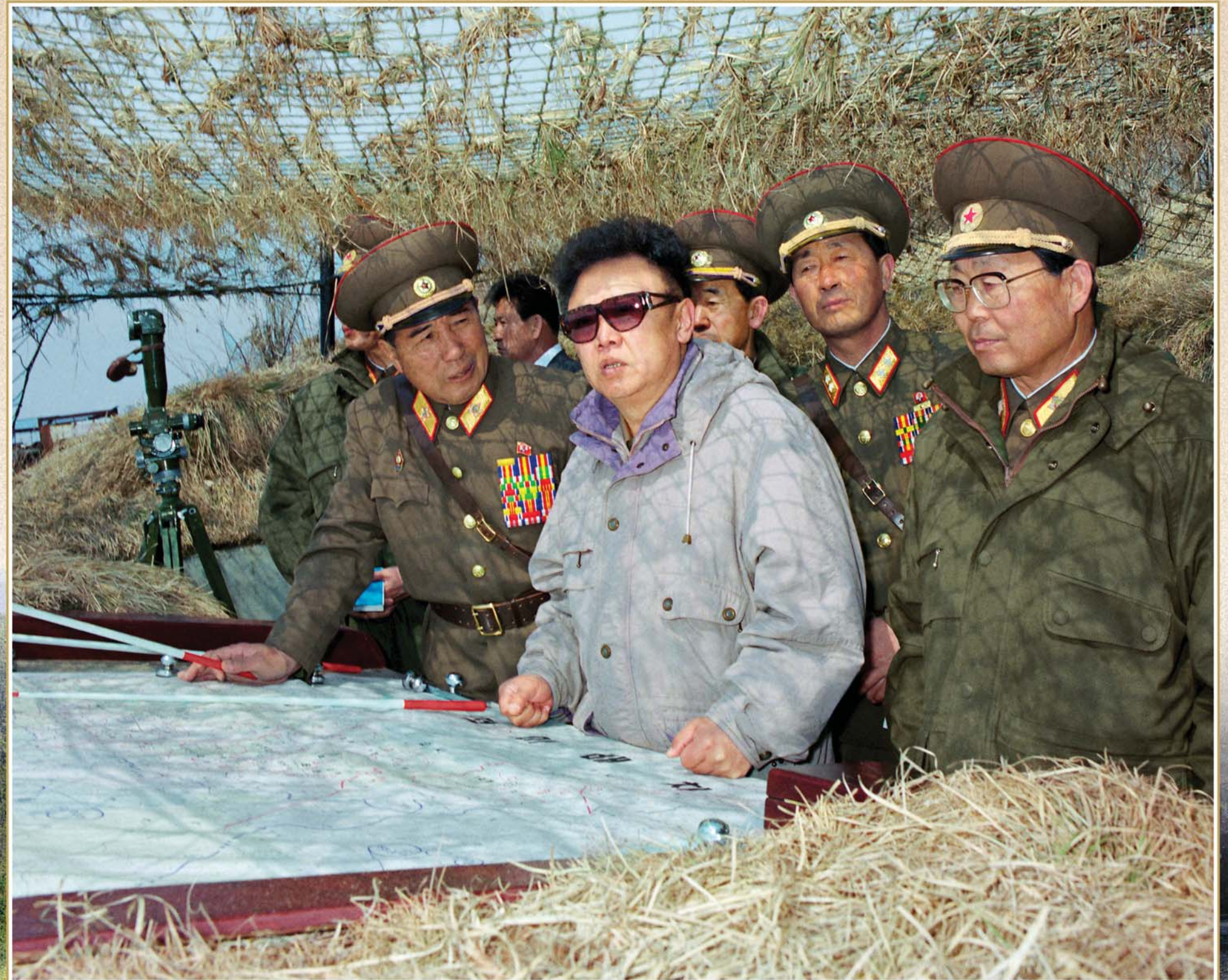
Kim Jong Il at a forward command post in April Juche 86 (1997)

Recollecting his Songun-based revolutionary leadership, the Korean people are burning their hearts with a single mind to add eternal lustre to his exploits and build a Juche-oriented thriving socialist country without fail.