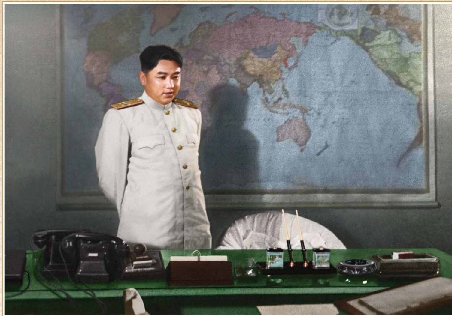
Kim Il Sung who led the Fatherland Liberation War to victory

For the DPRK, which was less than two years after founding, the Fatherland Liberation War (June 25, 1950-July 27, 1953) was a fierce battle decisive of the destiny of the country and people.