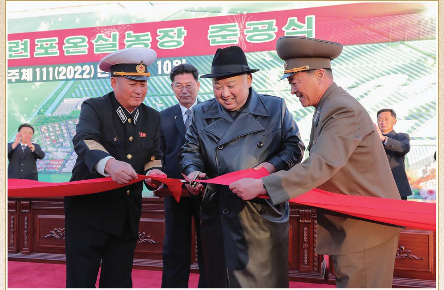
Kim Jong Un cutting a red ribbon at the inaugural ceremony of the Ryonpho Greenhouse Farm in October Juche 111 (2022)