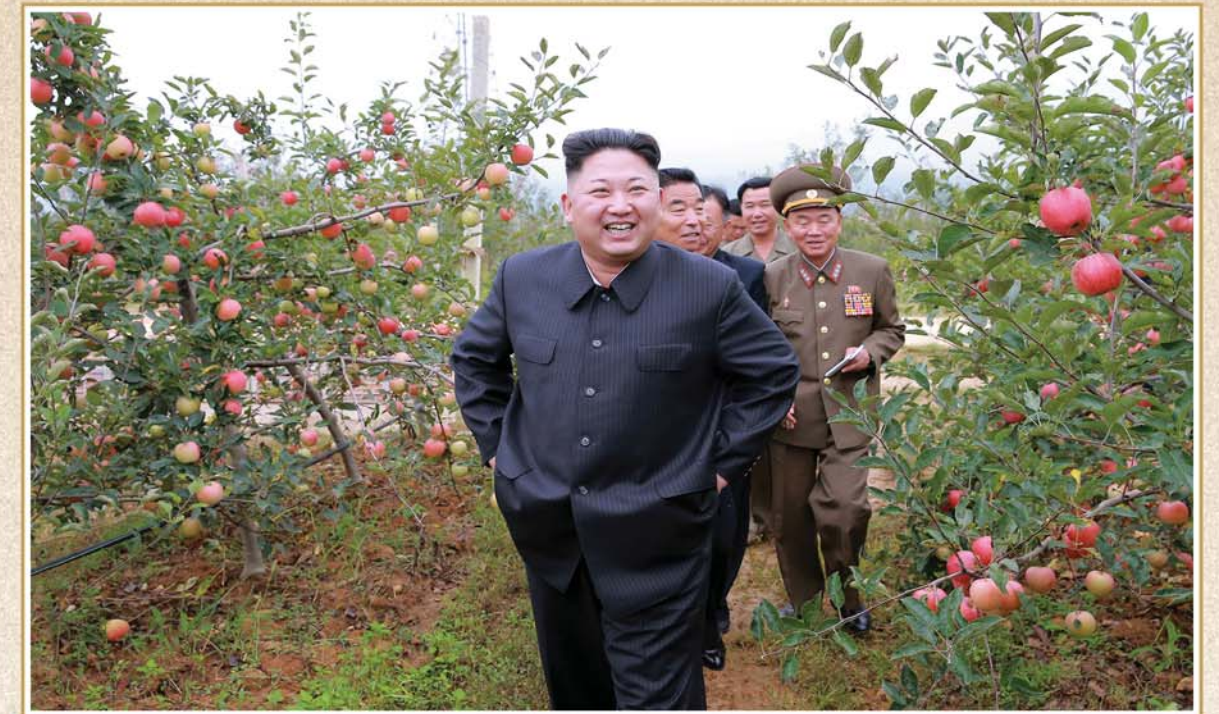
Kim Jong Un at the Kosan Combined Fruit Farm in September Juche 105 (2016)

Witnessing the proud reality of the DPRK advancing by leaps and bounds full of youthful vigour under the leadership of Kim Jong Un the Korean people are looking forward to the rosy future of the ever-prospering socialist country.