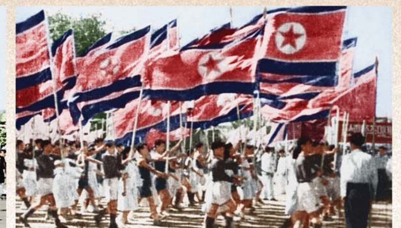
The founding of the DPRK instilled in the working people a great pride in and joy of being masters of the government.

The nationwide discussion on the national emblem, name and flag as well as draft Constitution took place, and the north-south general election was held on August 25 Juche 37 (1948).