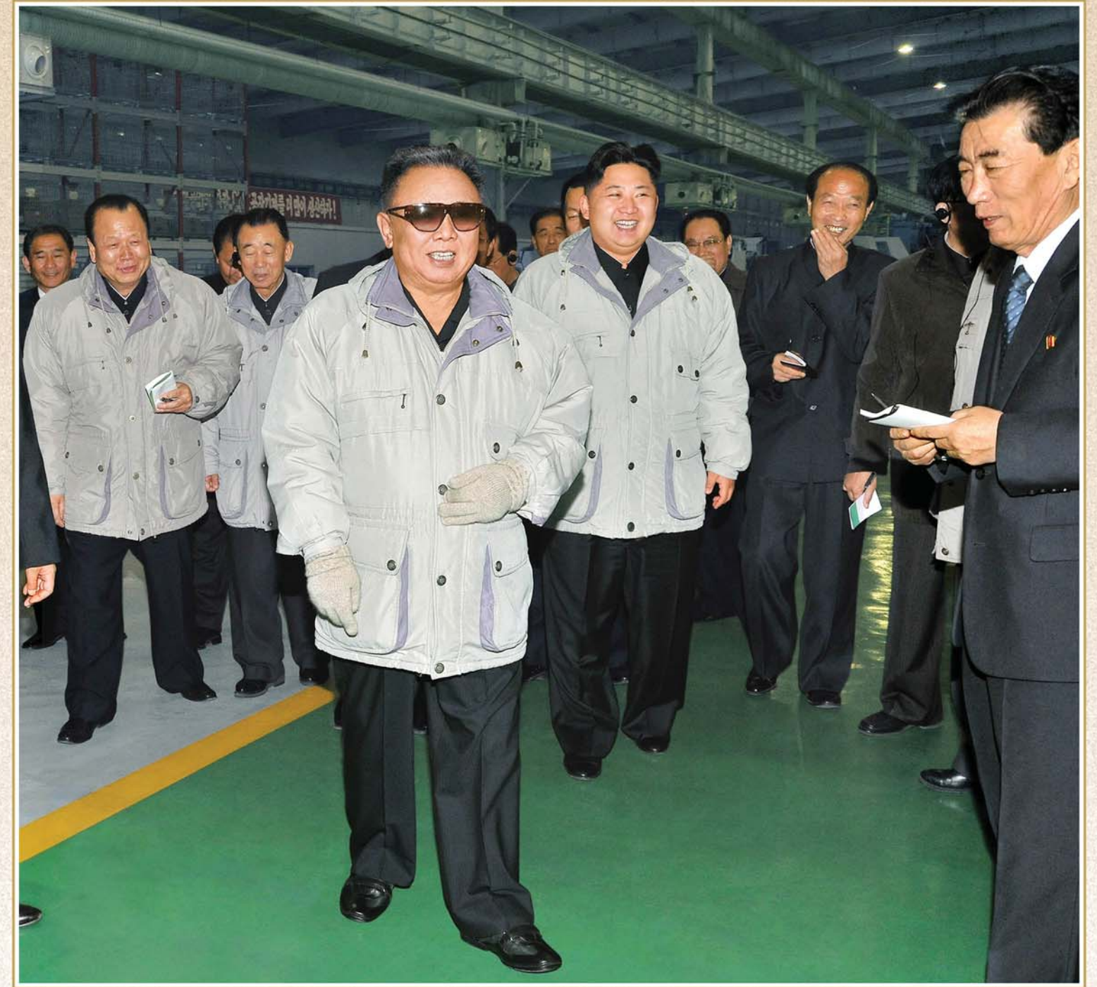
Kim Jong Il and Kim Jong Un at a machine factory in October Juche 100 (2011)

challenges and trials and which always emerges victorious and carries out its intentions at will.