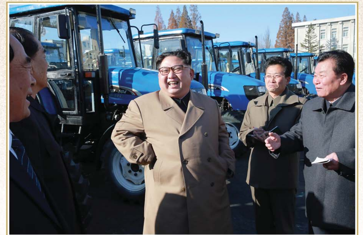
Kim Jong Un at the Kumsong Tractor Factory in November Juche 106 (2017)