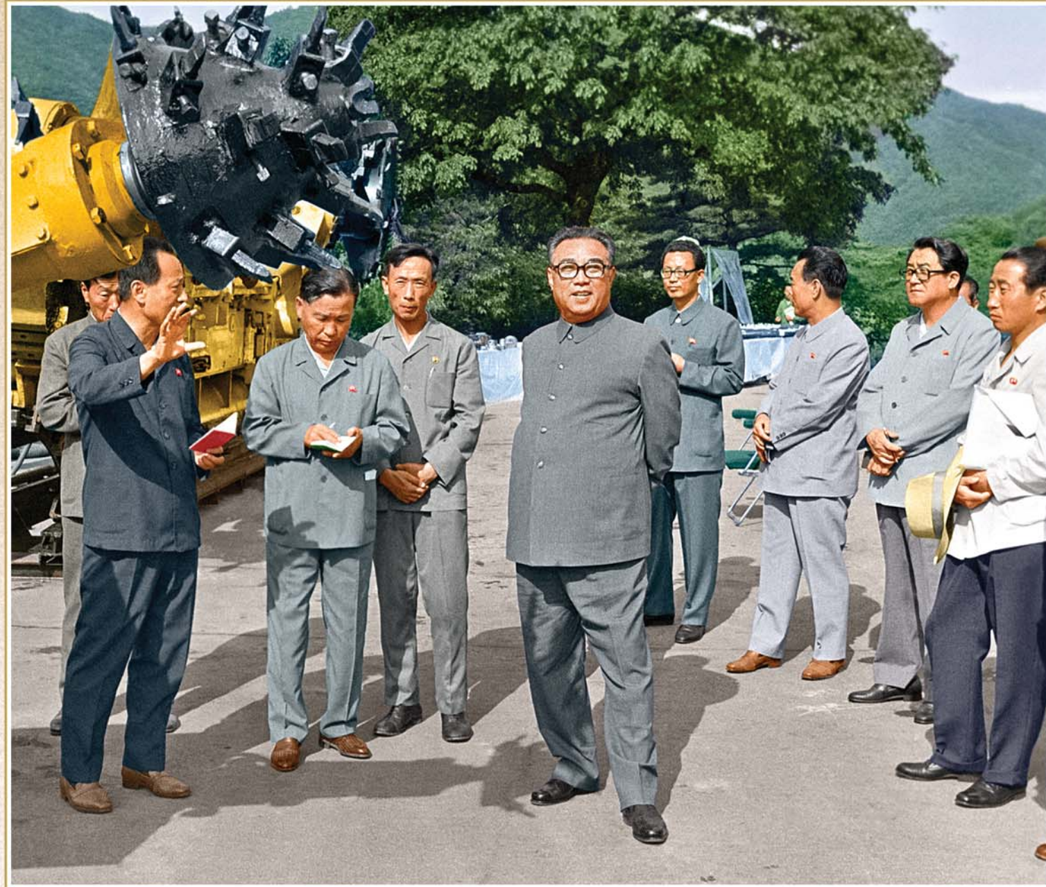
Kim Il Sung seeing coal cutter and universal drilling machine manufactured at the May 10 Factory in July Juche 69 (1980)

peaks of socialism and roused all the people to the all-round socialist construction.