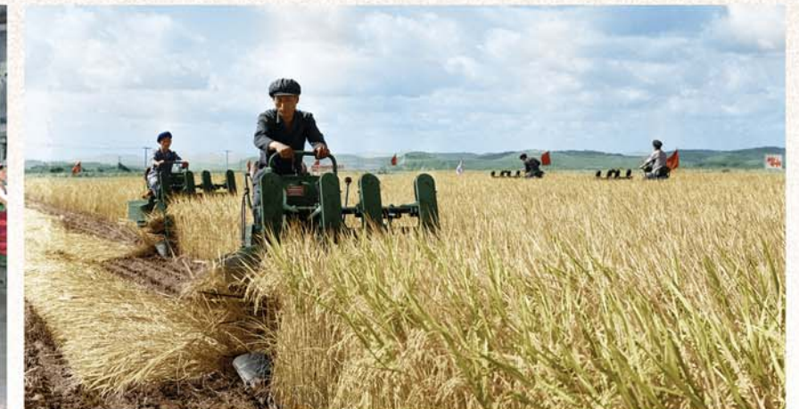
Material and technological foundations were consolidated in the heavy and light industries, agriculture and other sectors of the national economy.