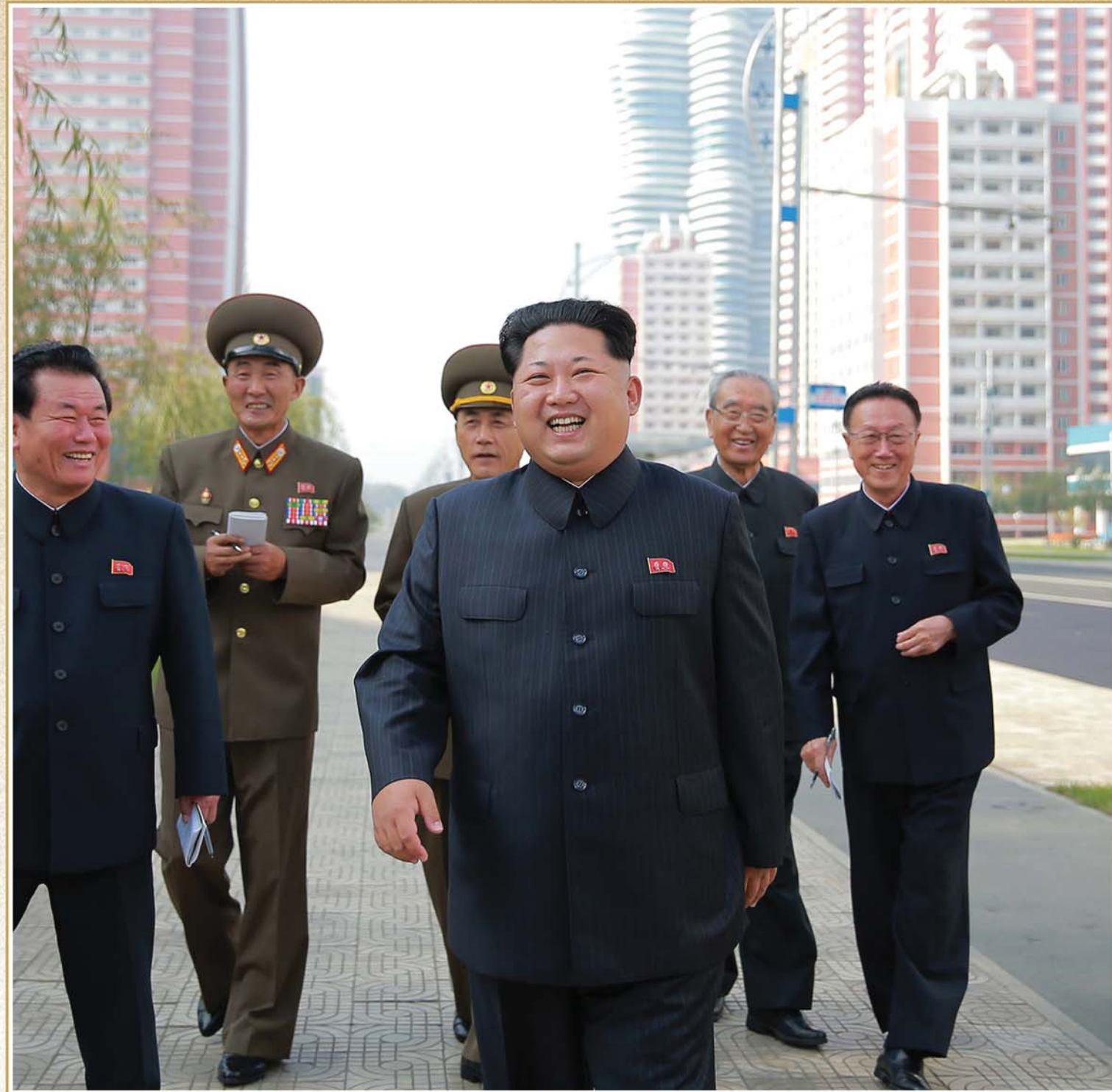
Kim Jong Un looking round Mirae Scientists Street in October Juche 104 (2015)

The iron truth that a people and a country led by a great leader demonstrate their dignity as a great people and an invincible powerful country has been proved in reality in socialist Korea during the period from the outset of the new century of the Juche era.