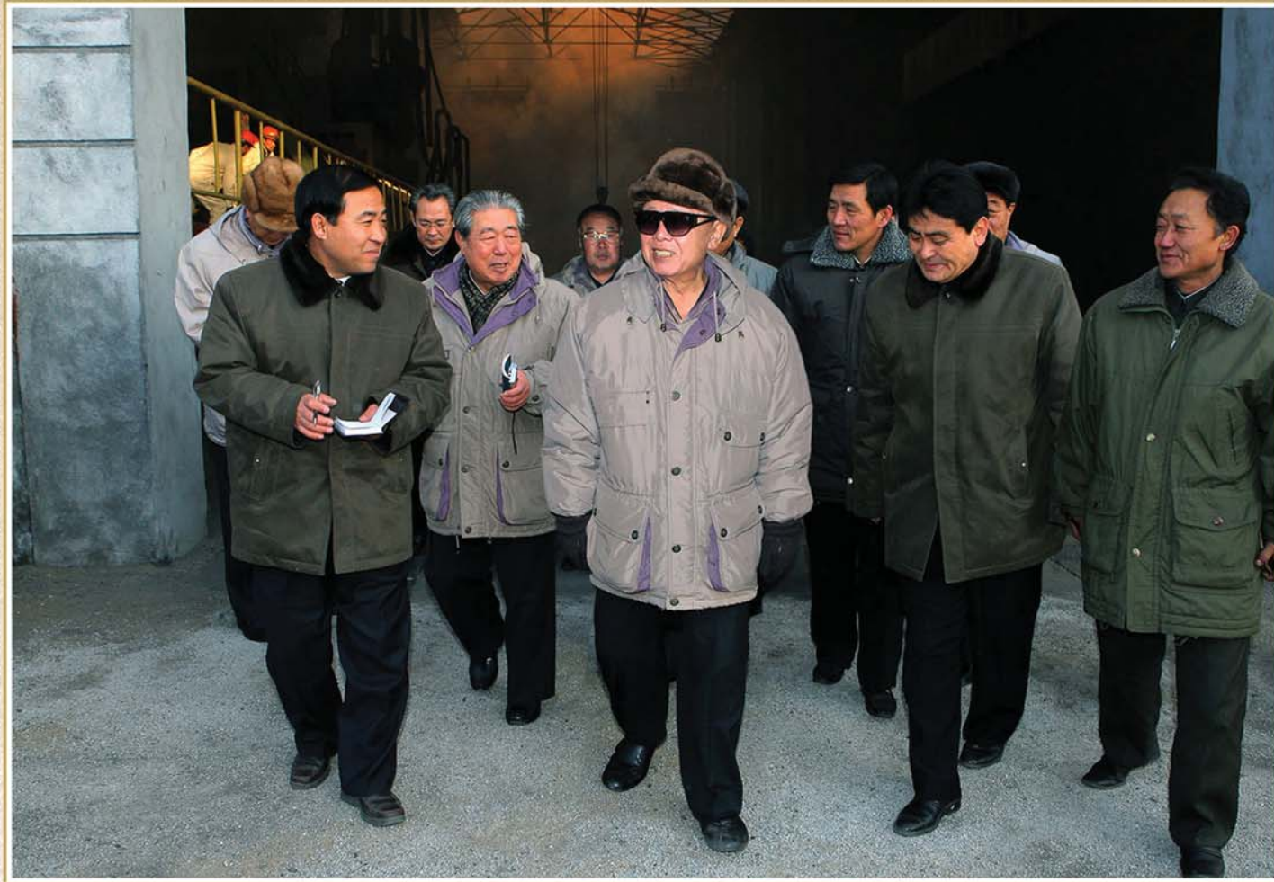
Kim Jong Il visiting the Songjin Steel Complex which perfected the Juche-based iron production system in December Juche 98 (2009)